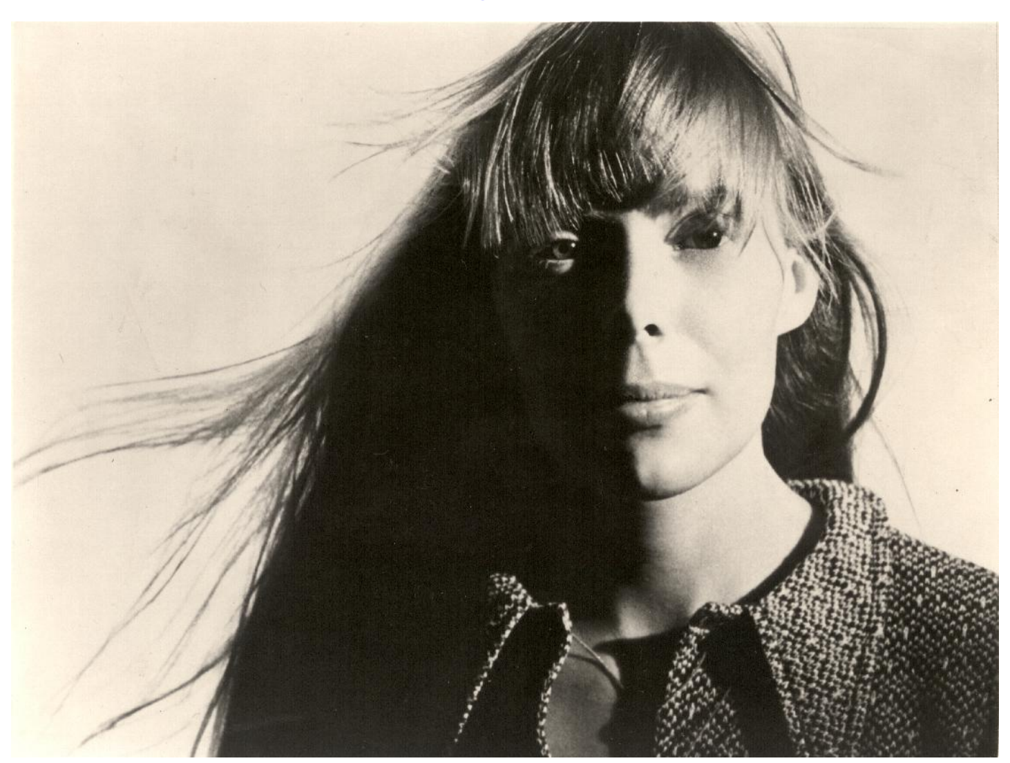
March 1968