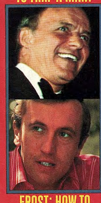
FROST: HOW TO Love a Woman!