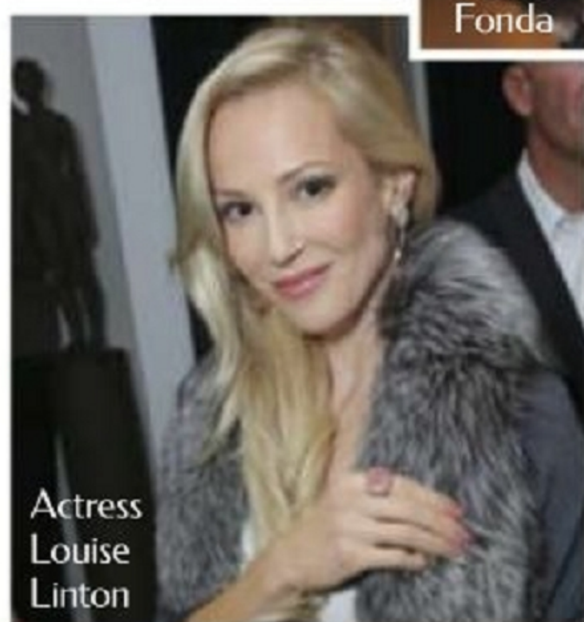
Actress Louise Linton