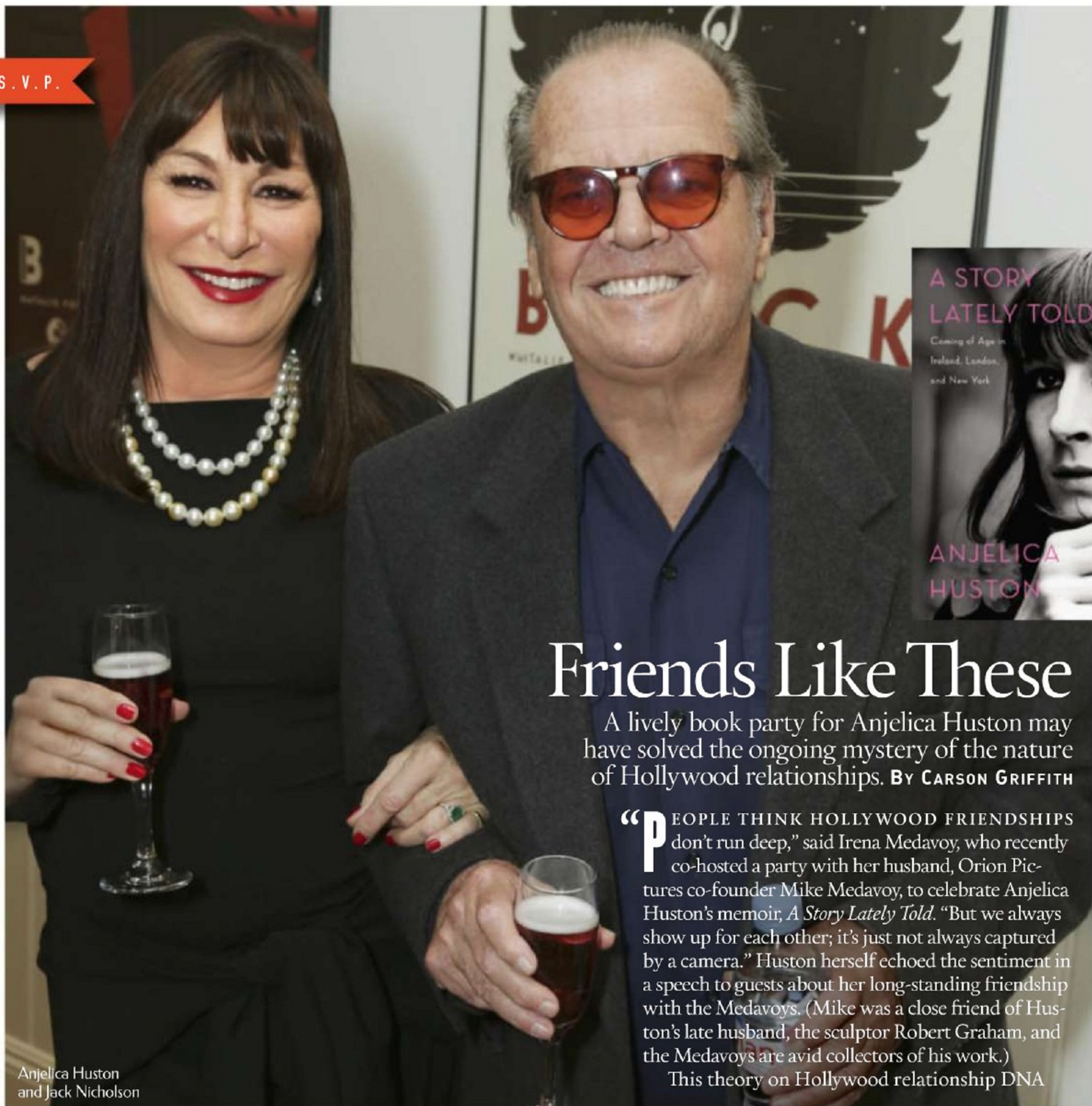
Anjelica Huston and Jack Nicholson