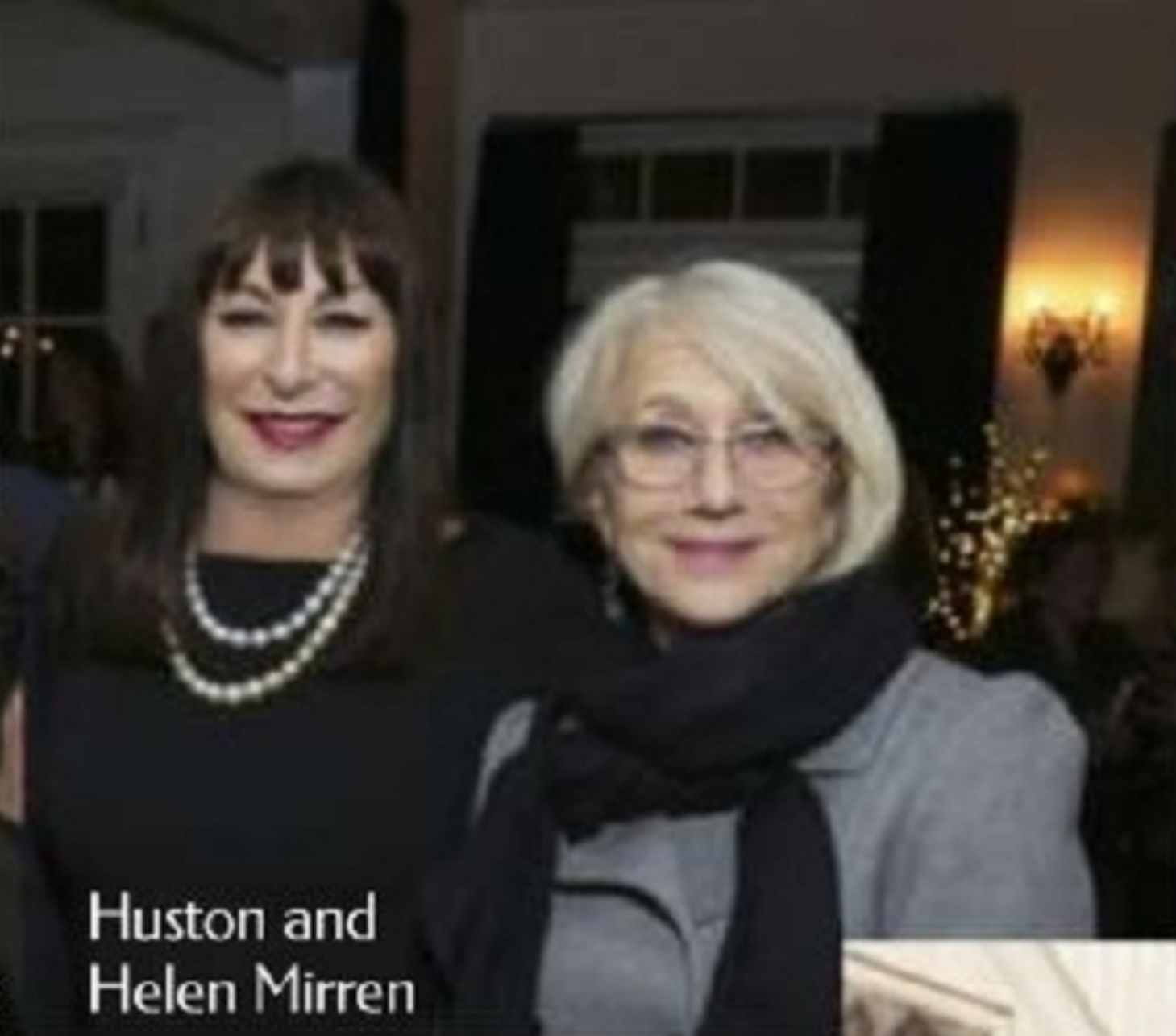
Huston and Helen Mirren