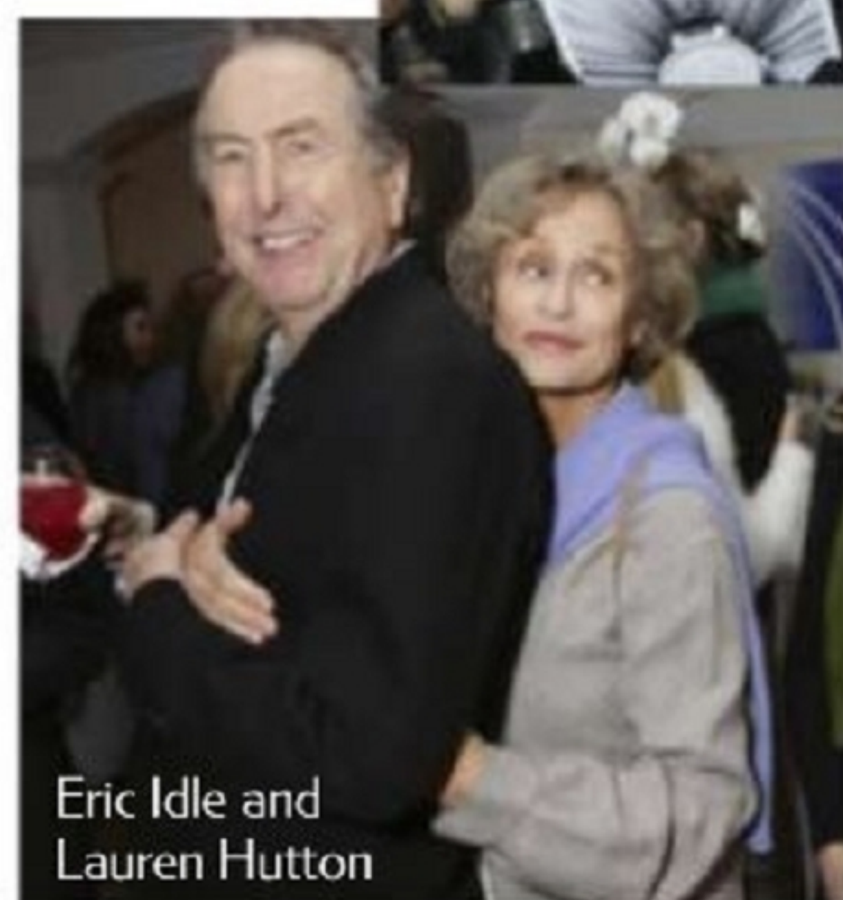
Eric Idle and Lauren Hutton