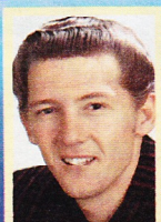
Jerry Lee Lewis