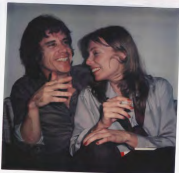
Joni - John Guerin

by "Song For Sharon", where bassist Max Bennett (not, you'll note, Jaco Pastorius here) and drummer John Guerin empathetically track Mitchell's voice and guitar for the best part of nine minutes.