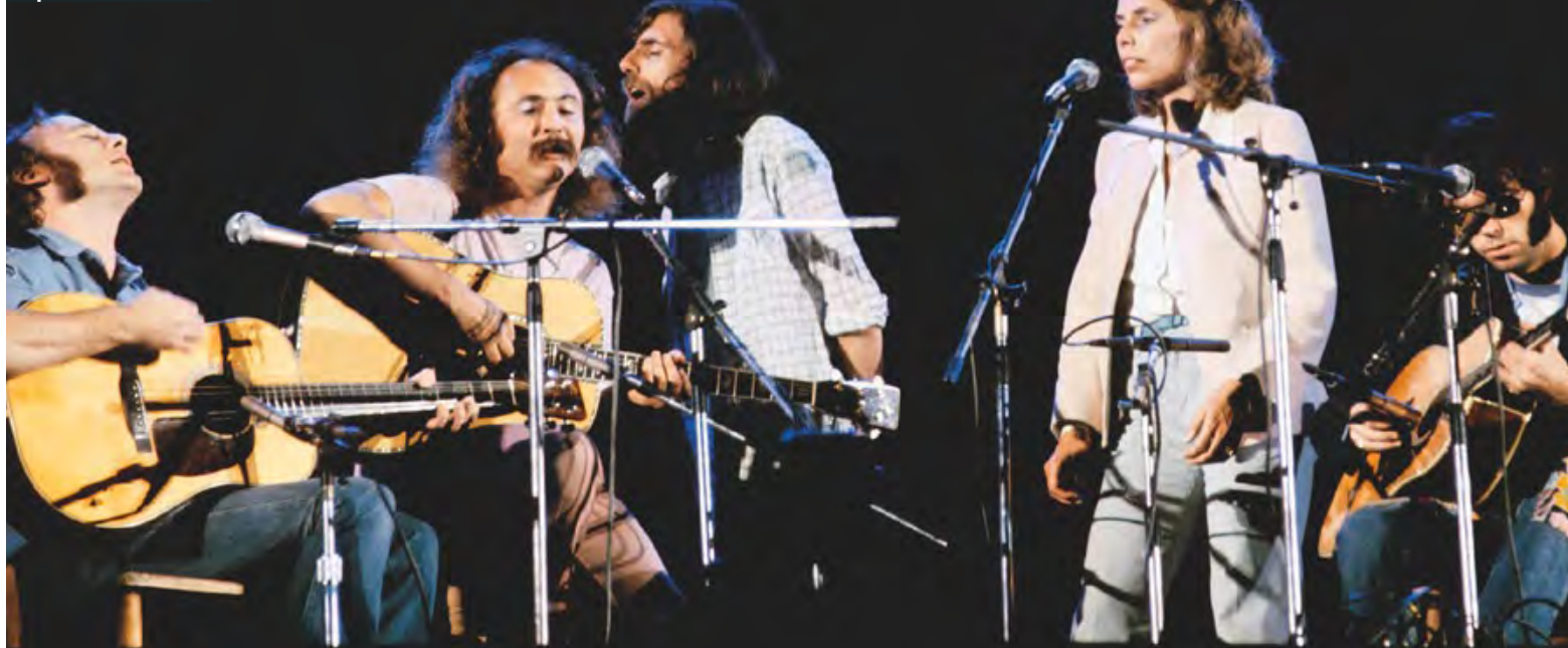
With Crosby, Stills, Nash And Young, Wembley Stadium September 14, 1974

We hope you enjoyed our 30 greatest Joni songs. But did we miss anything out? What are your favourite Joni songs? Why not send your Mitchell missives to uncut_feedback@timeinc.com