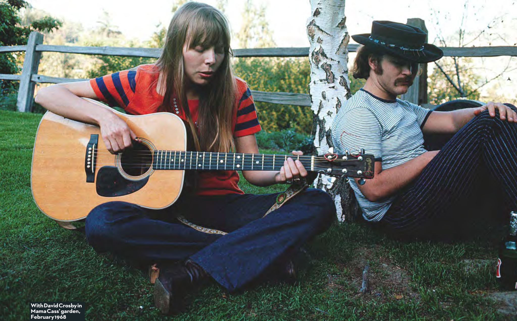
With David Crosby in Mama Cass' garden, February 1968

such that she takes a personal situation and turns it into a world situation. The relationship she's talking about can apply to anyone who's listening. That's the art of writing a great song, taking a simple thing and making astounding music from it. There are so many great songs for a start. I really believe that in a hundred years from now, when people look back on the '60s, the great writers will be Bob Dylan, John and Paul, and Joni. I like "Amelia", I think it speaks directly to your heart, and there is not much in the way of production. She concentrates on the lyrics and the melodies of her music and she wants to find the shortest path from your brain to your heart. She consistently does that. If you listen to "For The Roses", for instance... my God! Listen to "A Case Of You": holy shit, it goes straight to your heart! I love "River" on Blue , too. She influenced me, as well. There's a couple of songs I've written in tunings that I learned from Joni, particularly "Lady Of The Island". I got tunings from Crosby, too, because he's a maniac that way. Hey, you know it's her birthday today? I've been sending her flowers on her birthday ever since the day we parted. Let's wish Joni a happy birthday today.