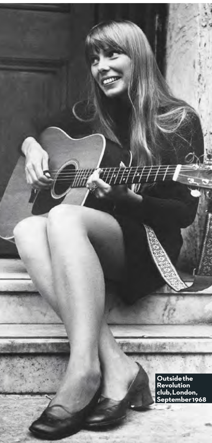
Outside the Revolution club, London, September 1968