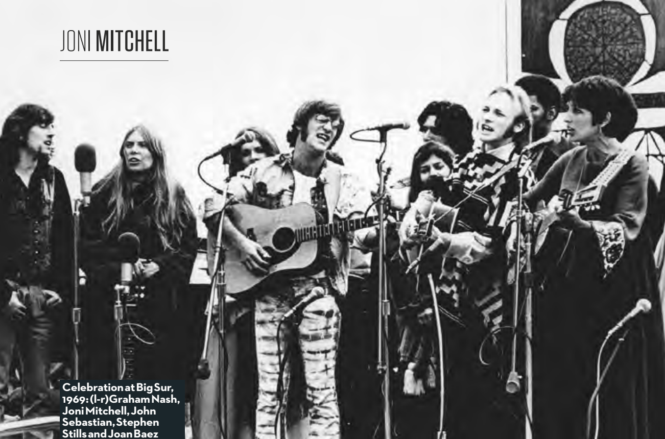
Celebration at Big Sur, 1969: (l-r) Graham Nash, Joni Mitchell, John Sebastian, Stephen Stills and Joan Baez

➤ There was Joan Baez, Judy Collins and a few others, but they were following more traditional lines. Joni just came right out front and said, “I’m gonna do it my way.” She was so doggone good that you couldn’t argue with her. I love everything she does. I love the early albums, because those were the ones I was first familiar with and first struck by. Songs like “The Circle Game”. People who create are out there to open new avenues, and Joni Mitchell is definitely one of the strongest we had last century. I never met her – I was in Topanga Canyon, and she was more in her community of people in Laurel Canyon, a lovely little haven but very close to the city. Not everybody may agree, but I never feel a personality that strong doing something so well is a first-timer at it, there’s a history as a soul.