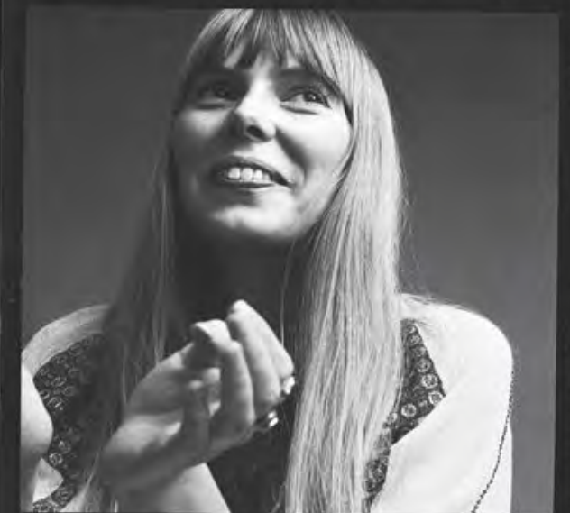
A photographer's contact sheet of Joni Mitchell, shot for Vogue, November 20, 1968