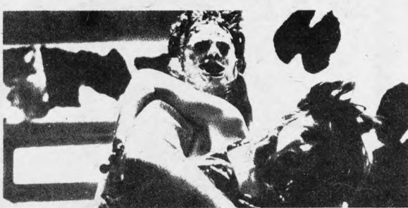
Everyone comes out on Halloween.

marked by everything from fàshionable murder-ala-chic to senseless slaughters on a lomotive to the gruesome killings at a senior prom.