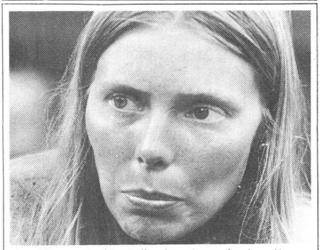
"I wanted to talk about confusion.

and luxury canceled creativity. I still had that stereotyped idea that success would deter creativity, would stop the gift, luxury would make you too comfortable and complacent and that the gift would suffer from it. But I found the only way that I could reconcile with myself and my art was to say this is what I'm going through now, my life is changing and I am too. I'm an extremist as far as lifestyle goes. I need to live simply and primitively sometimes, at least for short periods of the year, in order to keep in touch with something more basic. But I have come to be able to finally enjoy my success and to use it as a form of self-expression, and not to deny. Leonard Cohen has a line that says, "do not dress in those rags for me, I know you are not poor," and when I heard that line I thought to myself that I had been denying, which was sort of a hypocritical thing. I began to feel too separate from my audience and from my times, separated by affluence and convenience from the pulse of my times. I wanted to