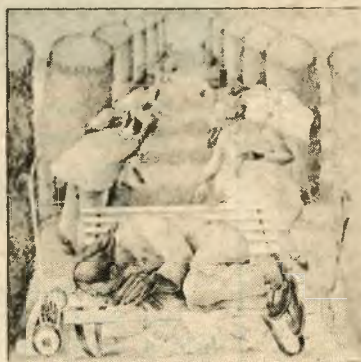
SELLING ENGLAND BY THE POUND

enjoyed airing on FM station, including "I Know What I Like" and "The Cinema Show". Much of the music is thematically parallel to that of Jethro Tull both in content and structure. However, Genesis moves their melodies at a slower more dreamlike pace.