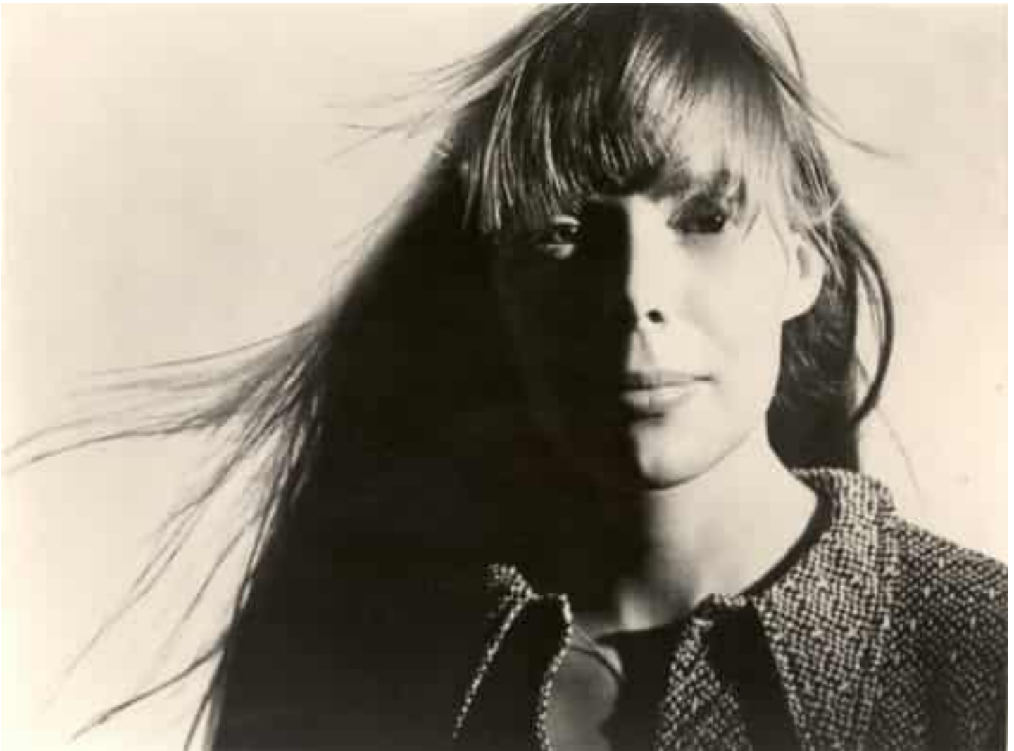
© Ed Thrasher - March 1968

Please send comments, corrections or additions to: simon@icu.com