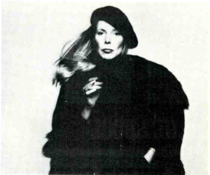
Hejira: Joni Mitchell Asylum 7E-1087 , stereo, $6.98.

Last year's Hissing of Summer Lawns was not an easy pill to swallow. A total departure from the phenomenally successful Court and Spark , it was a daring, highly idiosyncratic and lavish album that some people did not like at all.