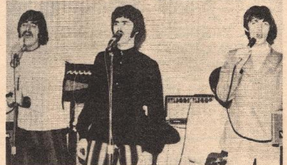
THREE DOG NIGHT... hot new Coast group.