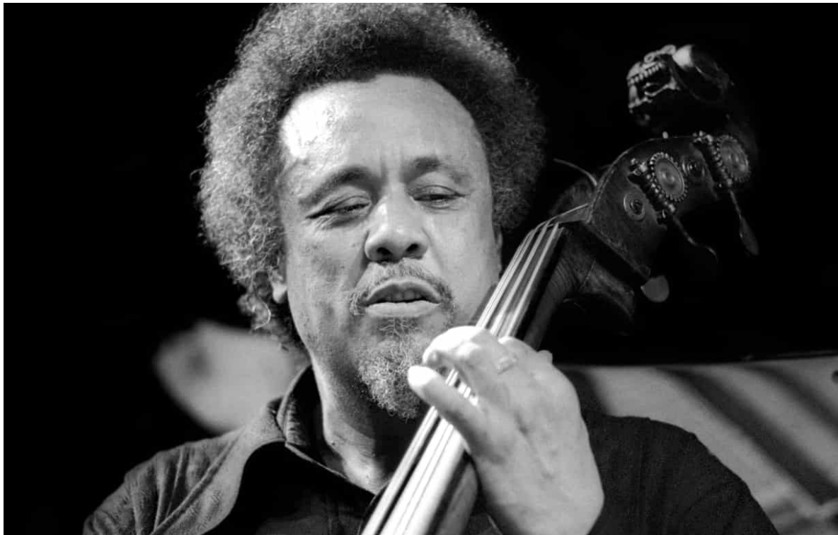
Dynastic: Charles Mingus performs in San Francisco, 1977.